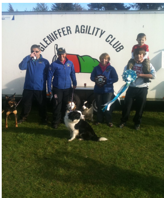
Winning Club—TT Agility